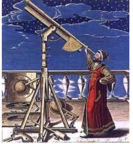
Figure 5: Astronomy and Astrosociology

formal expansion of astrosociology on the astrosociological frontier represents an extremely important move forward. ix A good placement for astrosociology during introduction