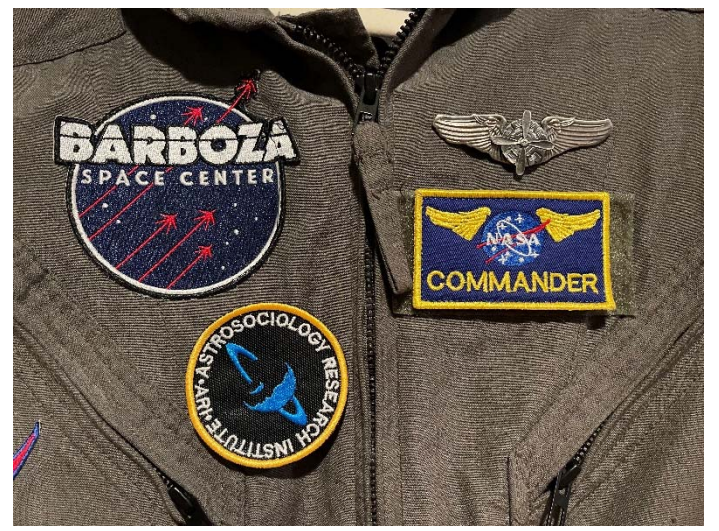
Figure 10: Flight Suit Patches for Students

The first conceptual design of the Tiger Teams for the first session consisted of four teams that included five members (see Figure 9). However, the first scheme for the Fall 2021 semester consists of three teams with ten students in each. These students were introduced to the academic