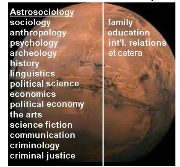
Figure 1: Astrosociology as a Multidisciplinary Academic Field

For those unfamiliar with the history and definition of astrosociology, this author founded this