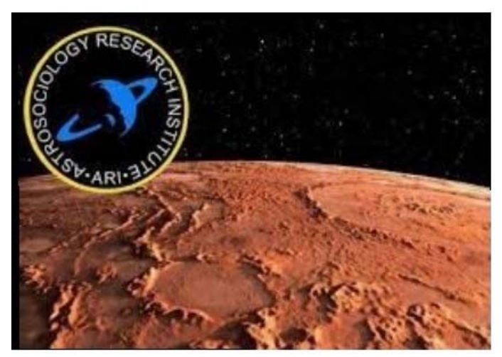
Figure 2: Astrosociology on Mars

The additional focus on social-scientific factors will create the burden of understudied concepts in