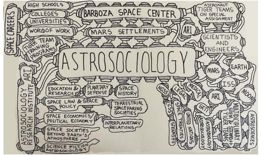
Figure 7: Astrosociology in Leadership Position

In essence, the temporary nature of the classical Tiger Teams is exemplified by high school students due to the fact that they graduate from the program after their semester ends. On the other hand, the fact that each team consists of