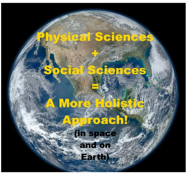
Figure 3: A More Holistic Approach

But why is there such a lack of participation of non-STEM academicians and experts in this particular area of sociocultural research? Why is astrosociological education so severely lacking? One of the important forces that has contributed to this unfocused approach to space exploration has been the emphasis on the physical requirements necessary for a successful short-duration mission. Permanent settlement beyond Earth places unique and extremely challenging requirements that continue long beyond the landing on the Martian surface. Thus, there is a strong argument that can be made that too few social scientists study astrosocial phenomena compared to STEM-oriented