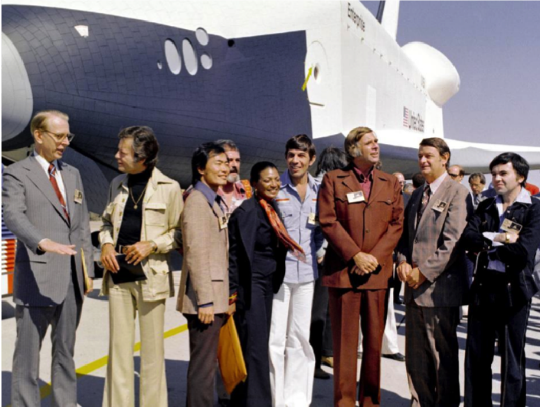
The shuttle Enterprise. In 1976, NASA's space shuttle Enterprise rolled out of the Palmdale manufacturing facilities and was greeted by NASA officials and cast members from the "Star Trek" television series. From left to right they are: NASA Administrator Dr. James D. Fletcher; DeForest Kelley, who portrayed Dr. "Bones" McCoy on the series; George Takei (Mr. Sulu); James Doohan (Chief Engineer Montgomery "Scotty" Scott); Nichelle Nichols (Lt. Uhura); Leonard Nimoy (Mr. Spock); series creator Gene Roddenberry; an unnamed NASA official; and, Walter Koenig (Ensign Pavel Chekov).

education and research regarding space-related issues – did not exist beforehand. It had to be invented because almost fifty years of the space age had gone by without adequate social-scientific attention to space issues, or more precisely, to the innumerable effects of astrosocial phenomena on societies around the world.