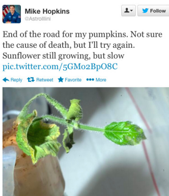
Image 3. Plant with a few leaves, withering.