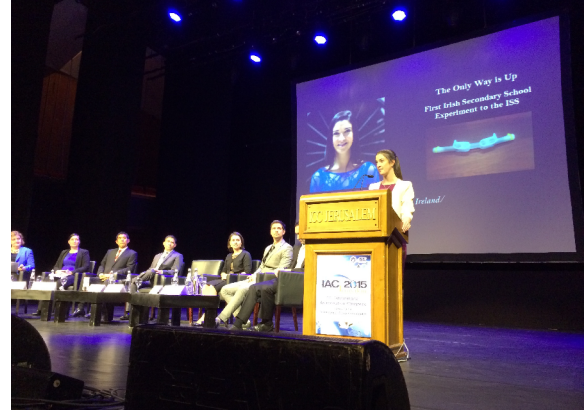
Image 2. Norah Patten at the Next Generation Plenary at the 2015 International Astronautical Congress conference.