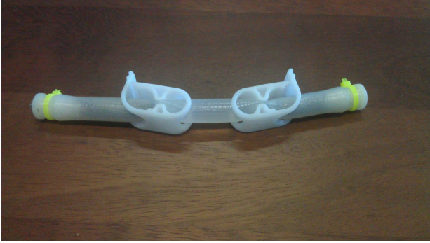
Image 1. NanoRacks Mixstix device for delivering student projects to the ISS.