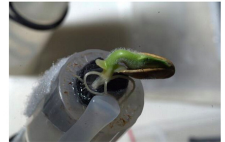
Image 4. Sprout with seed still attached growing out of metal container.

These ISS seedlings seemed to have the same precarious relationship with survival that house and office plants do, they depend on our care, on human attention for survival – but they are also threatened by it as we control their growth and reproduction – decide whether to care for them or not, where they will be, how long they will live. Were Hopkins’ space plants going to live or die? Online followers of space science were recently able to watch live as NASA streamed the first harvesting and consumption of plants grown for eating on the ISS. Watching this live-streamed event, I wondered what human relationships with plants in space might become in the future.