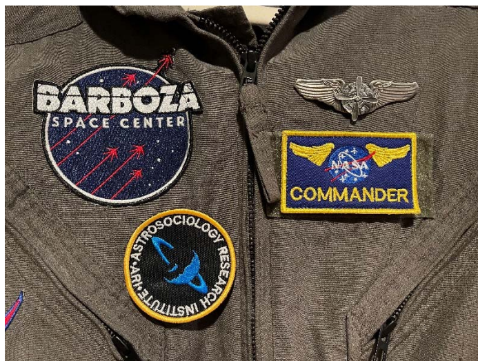
Figure 10: Flight Suit Patches for Students

The first conceptual design of the Tiger Teams for the first session consisted of four teams that included five members (see Figure 9). However, the first scheme for the Fall 2021 semester consists of three teams with ten students in each. These students were introduced to the academic