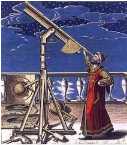
Figure 5: Astronomy and Astrosociology