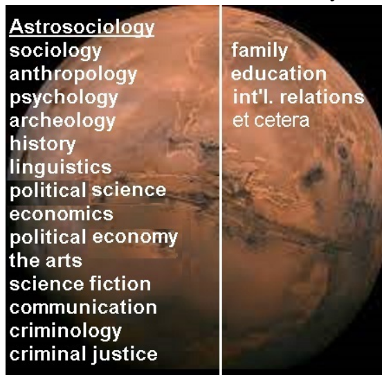
Figure 1: Astrosociology as a Multidisciplinary Academic Field

For those unfamiliar with the history and definition of astrosociology, this author founded this