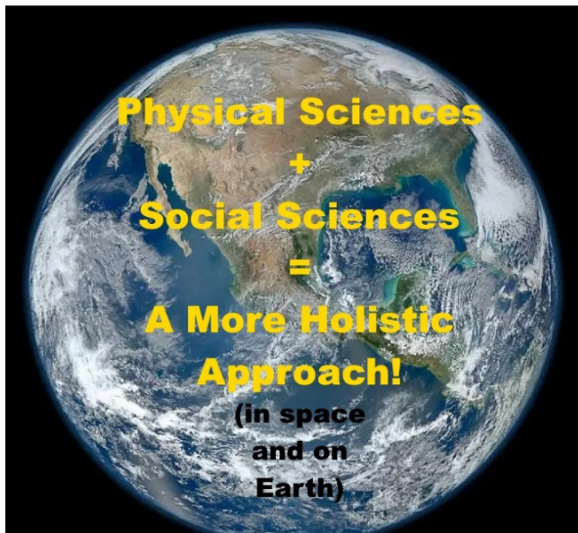
Figure 3: A More Holistic Approach

Few social scientists study space issues compared to those in the STEM disciplines. The result is less collaboration in planning for the mission and monitoring of settlement life. As on Earth, research must continue following the landing on Mars and subsequent construction of the habitats and supportive infrastructure. A severe dearth of social scientists educated and trained to understand the problems associated with replicating a social system beyond the Earth represents a problem moving forward that cannot be overstated in terms of its impact on any permanent settlement that may be contemplated.