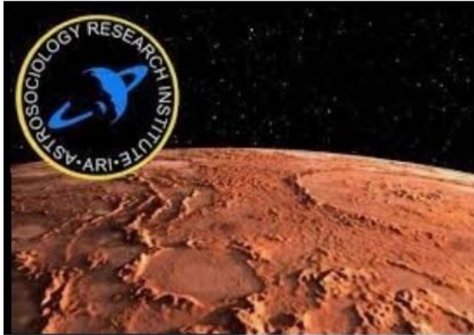
Figure 2: Astrosociology on Mars

The additional focus on social-scientific factors will create the burden of understudied concepts in