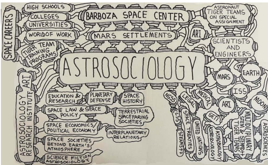
Figure 7: Astrosociology in Leadership Position

classical Tiger Teams is exemplified by high school students due to the fact that they graduate from the program after their semester ends. On the other hand, the fact that each team consists of