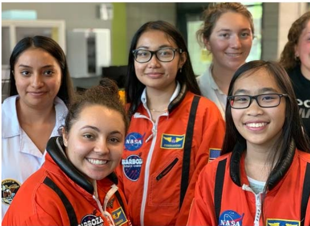
Figure 6: Tiger Team Instructors & Students

The sobriquet “Tiger Team” was invented by the press during the 1970 Apollo 13 crisis. The first Tiger Team was NASA’s mission-control team that figured out how to return the astronauts safely to earth. NASA’s sensational success made Tiger Teams part of our lexicon and a popular management practice. The phrase Tiger Team became synonymous with a temporary expert problem-solving team. xiii